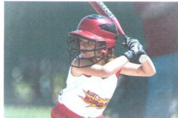
Softball Batting Helmet