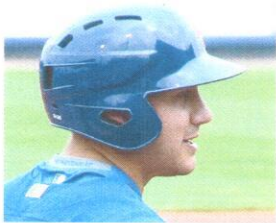
Baseball Batting Helmet

*Rentals Available (Sharing only allowed with Immediate Family please.)